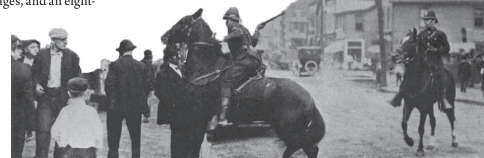
Police attack strikers during the Great Steel Strike of 1919

hour work day. The employers reacted with a national media campaign seizing on anti-immigration fears to divide the striking immigrant steelworkers from native-born workers. Lacking widespread support, the strike ended in 1920.