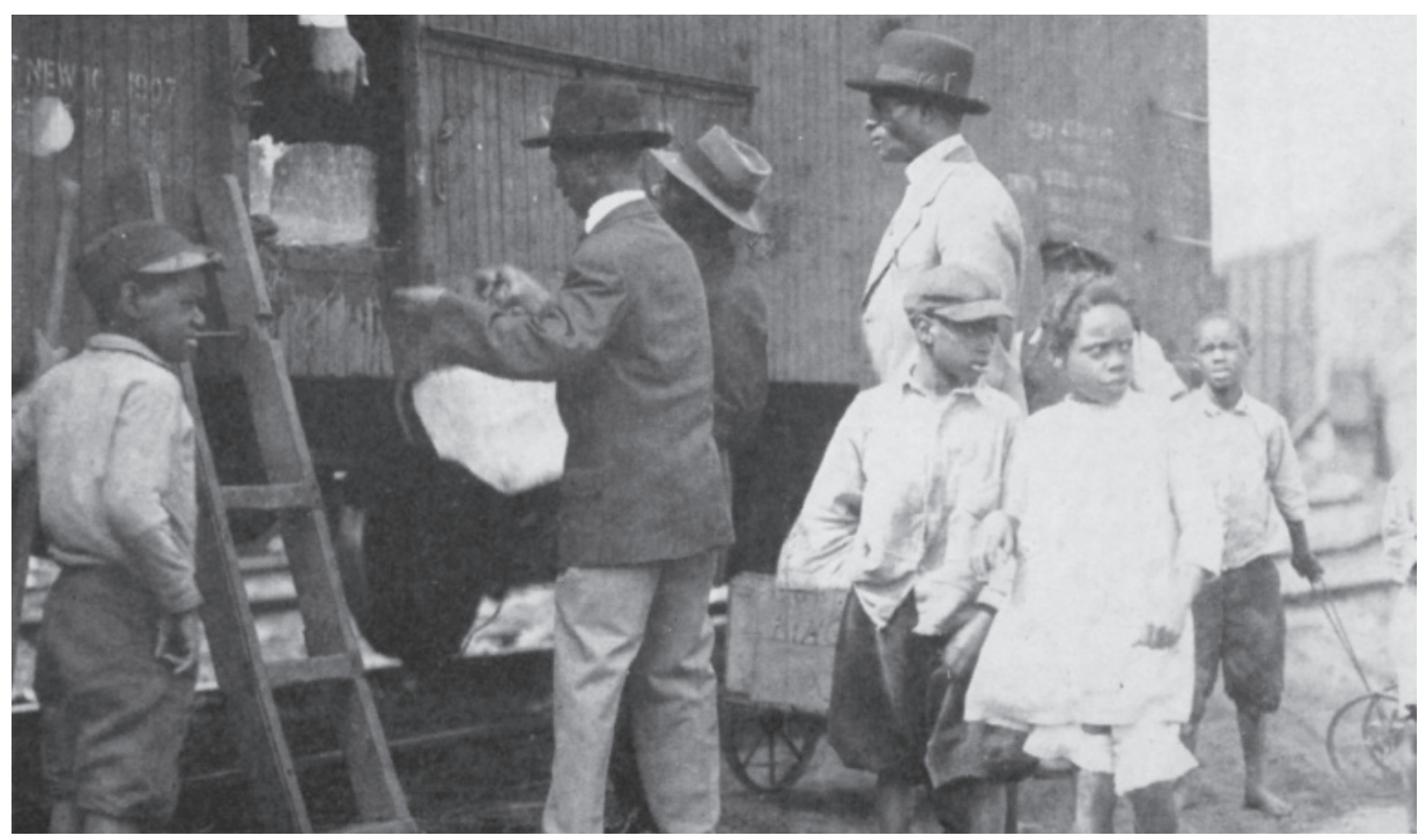
Chicago Commission on Race Relations. Buying ice from freight car switched into Negro residence area. 1922.